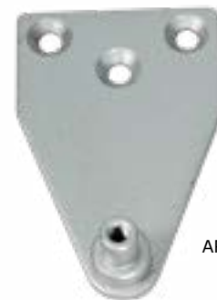
ARCHITRAVE BRACKET FOR FDCS3